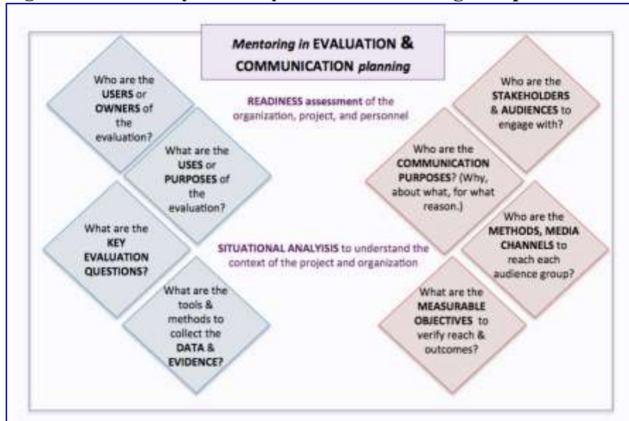
Figure 2: Summary of the hybrid's most strategic steps

Figure 2 shows Readiness Assessment and Situational Analysis as shared steps that are relevant throughout the duration of mentoring a project. The UFE steps (left side) and the corresponding ResCom steps (right side) can be done in parallel or sequentially. As mentioned before, readiness may appear promising at the start, but can wane over time. The same ongoing attention is needed on situational analysis, especially with projects that are experimental and where circumstances are likely to shift. Depending on the nature of the project, the process can be as short as 3 months or can extend for most of the duration of a 3-year project.